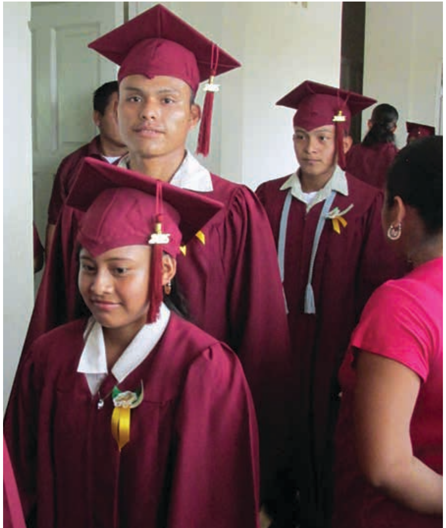
High school students at graduation.