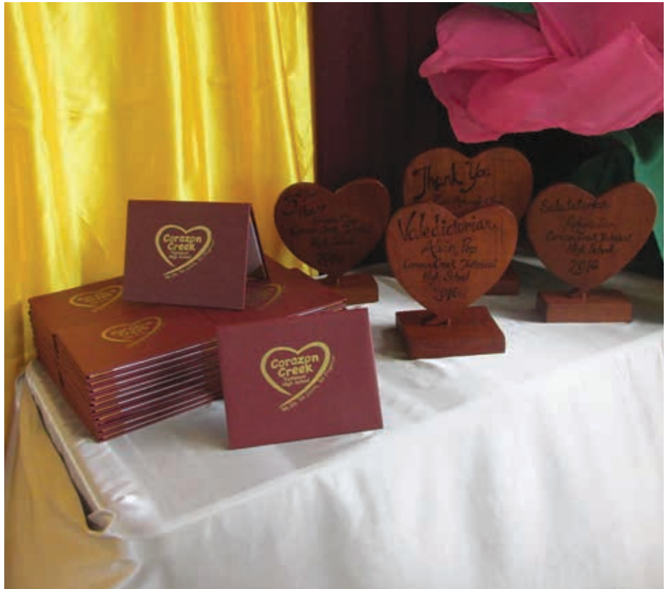
Diplomas and awards for students graduating from Corazon Creek Technical High School.

$2,400 will cover the cost of uniforms, tuition, school supplies, books and registration fees.