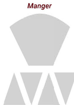
Group D: 4 triangles (for angel's wings)