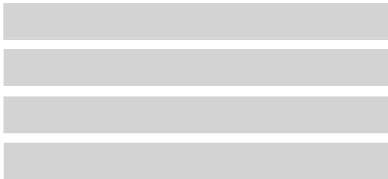
Group C: 4 long, thin rectangles (for the stable)