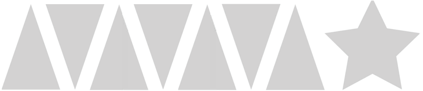
Group B: 7 triangles (for bodies)